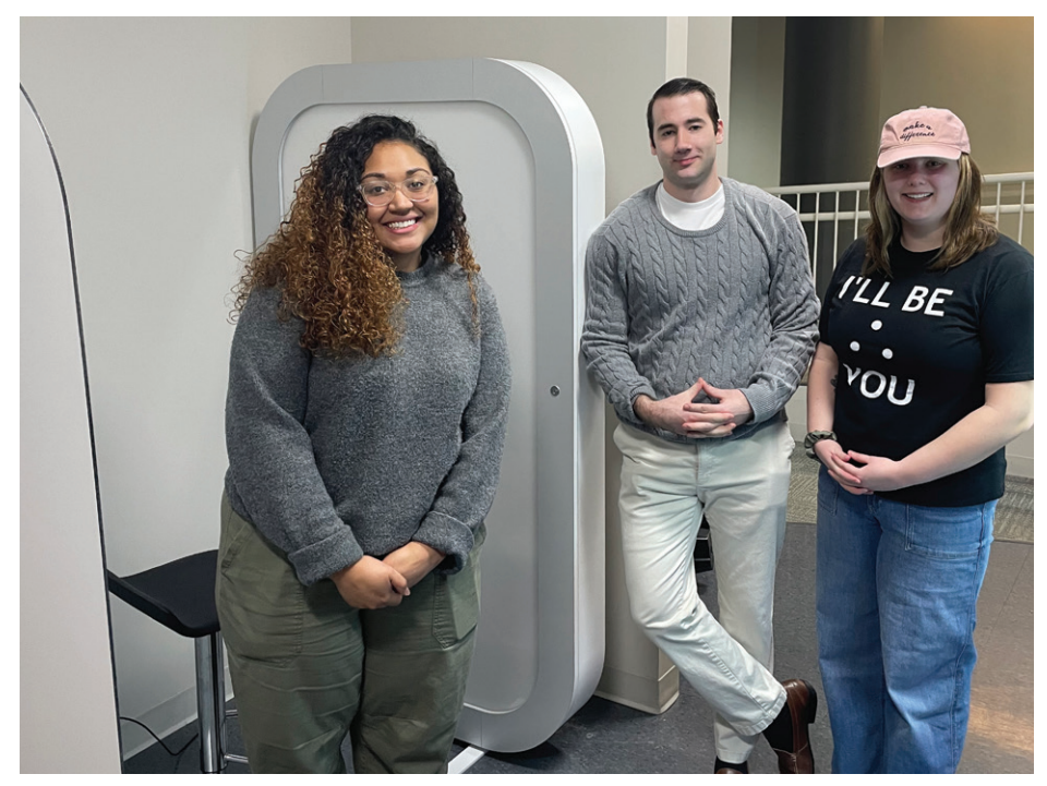
Students pose in front of the Iris Air Professional Photo Booth.

The Iris Air booth is centrally located on the second floor of the School of Law off the Veterans' Lounge near the vending machines and Career Closet. The booth is equipped with simple instructions guiding users through