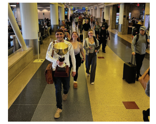
Flying the trophy back to Akron Law, the team said people in the Los Angeles Airport would applaud them without knowing what they won.

guidance throughout the entire season. Competing in the final round of the NCTC and hearing the announcement of our victory is a moment I will forever cherish—without a doubt, one of the highlights of my life and my law school journey. This experience has shaped us all into stronger advocates, and again, we could not have done it without our coaches."